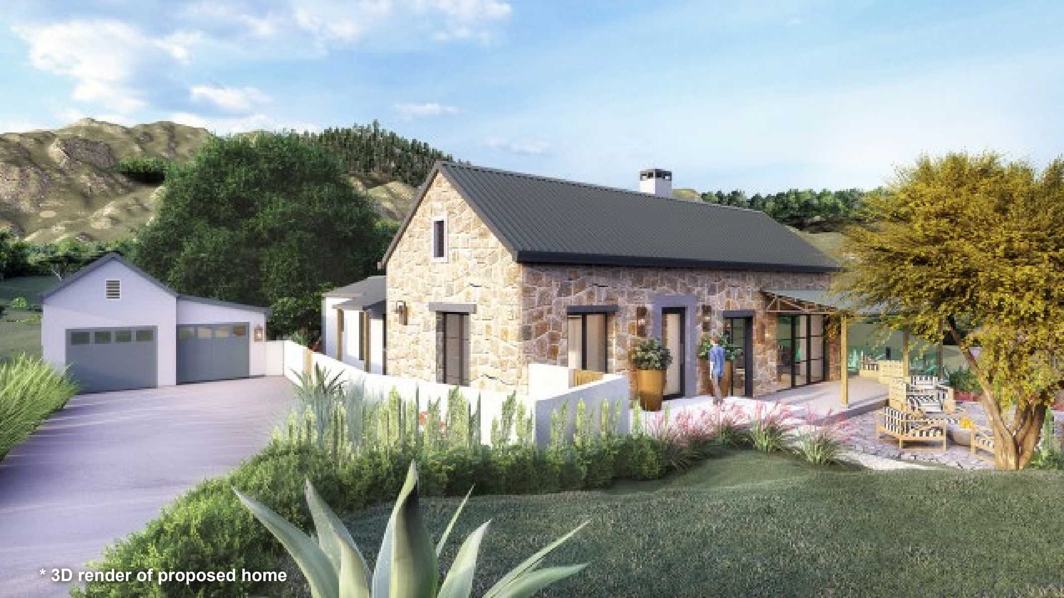
* 3D render of proposed home

It's rare to find and own a site like this, a flat pad in Malibu for single story under 2000 sf home with soon-to-be approved plans.