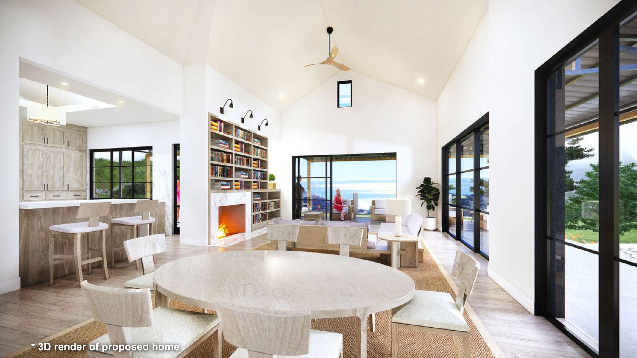
* 3D render of proposed home

This is the heart of the home. The main living area has dramatically pitched 16'9" ceilings framing a million dollar ocean view. The interior of the home is a love