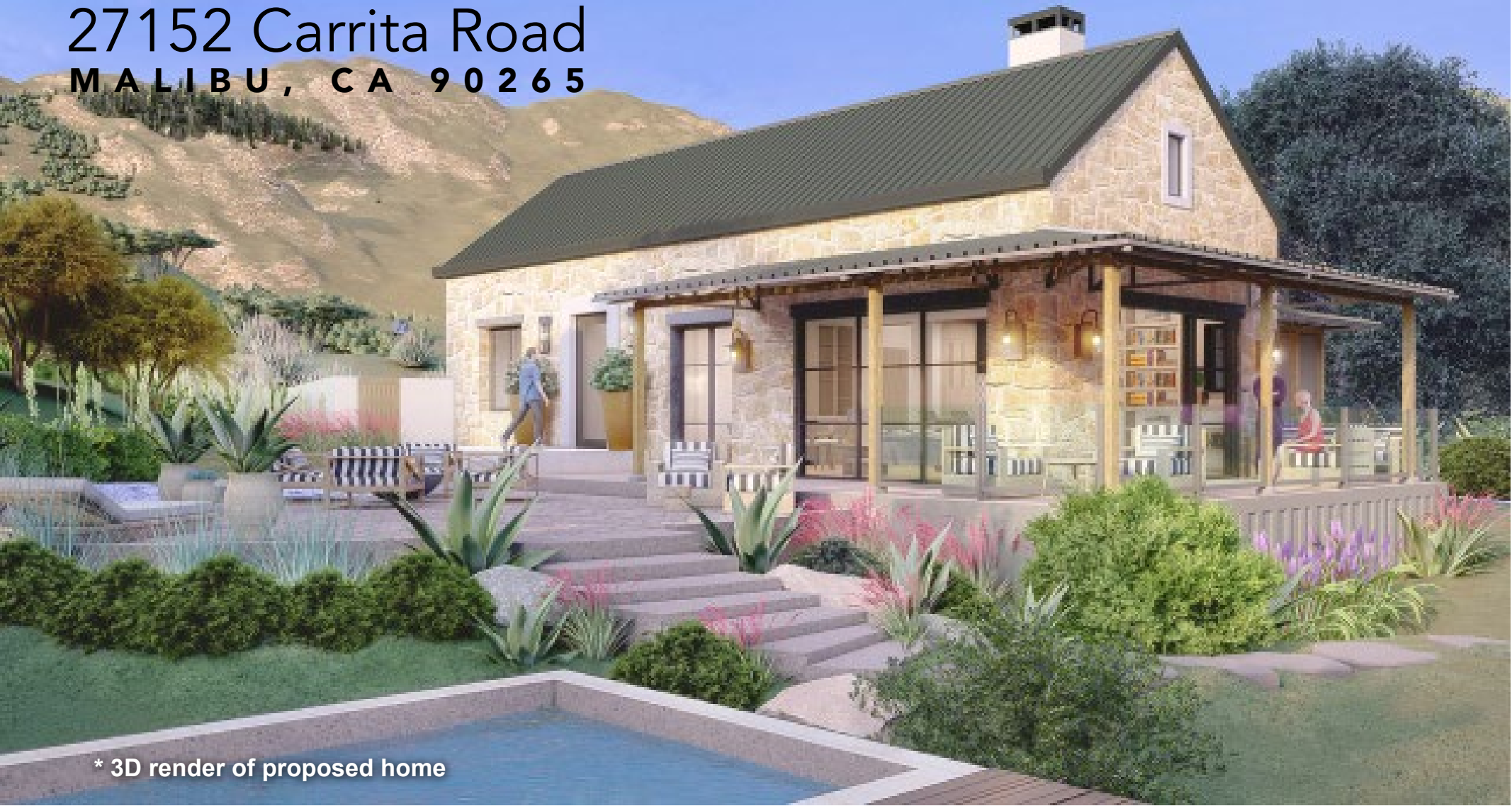
* 3D render of proposed home

Other design elements include several wrap around porches including screened-in porch, eight-foot doors and windows throughout, 9'6" ceilings in bedrooms and kitchen. Sustainably designed to its environment